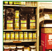
Organic Coffee and Teas