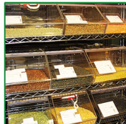
Organic Bulk Foods