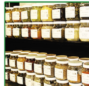
Organic Herbs and Spices