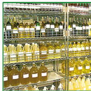
Organic Specialty Items