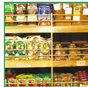
Organic Breads and Snacks